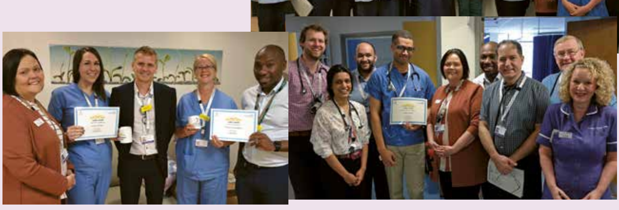
Some of the teams which have recently won Hillingdon's CARES monthly award.

Delivery equity for black and ethnic minority staff